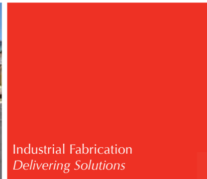
Industrial Fabrication Delivering Solutions